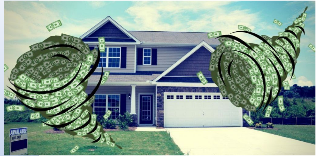
California Proposition 5